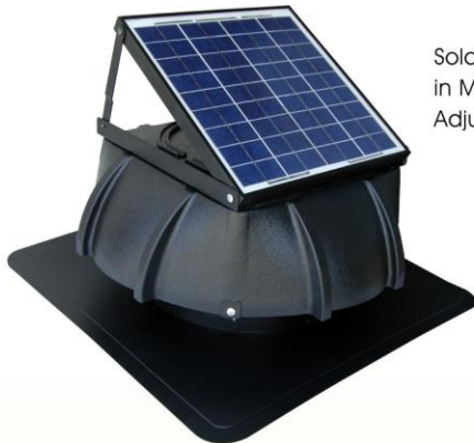
Solar Panel Shown in Medium Angle Adjustment

Comfort Living | Cool Summer | Dry Winter